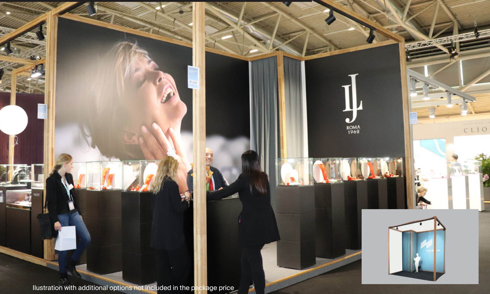
Illustration with additional options not included in the package price