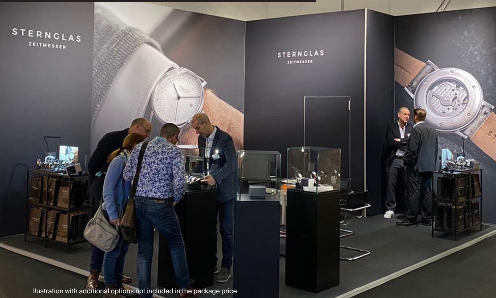
Illustration with additional options not included in the package price